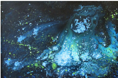
Deep Blue by Makailah Witka 2017 High School